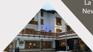
La Tzoumaz La Poste