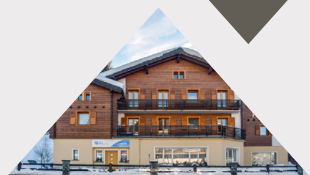
La Tzoumaz Campus